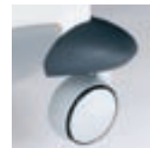
Wheel with brake

Zimmer Elektromedizin GmbH Junkersstraße 9 D-89231 Neu-Ulm Tel. +49. (0)7 31. 97 61-291 Fax +49. (0)7 31. 97 61-299 export@zimmer.de www.zimmer.de