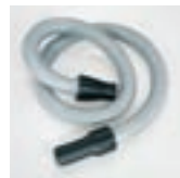
Standard treatment hose